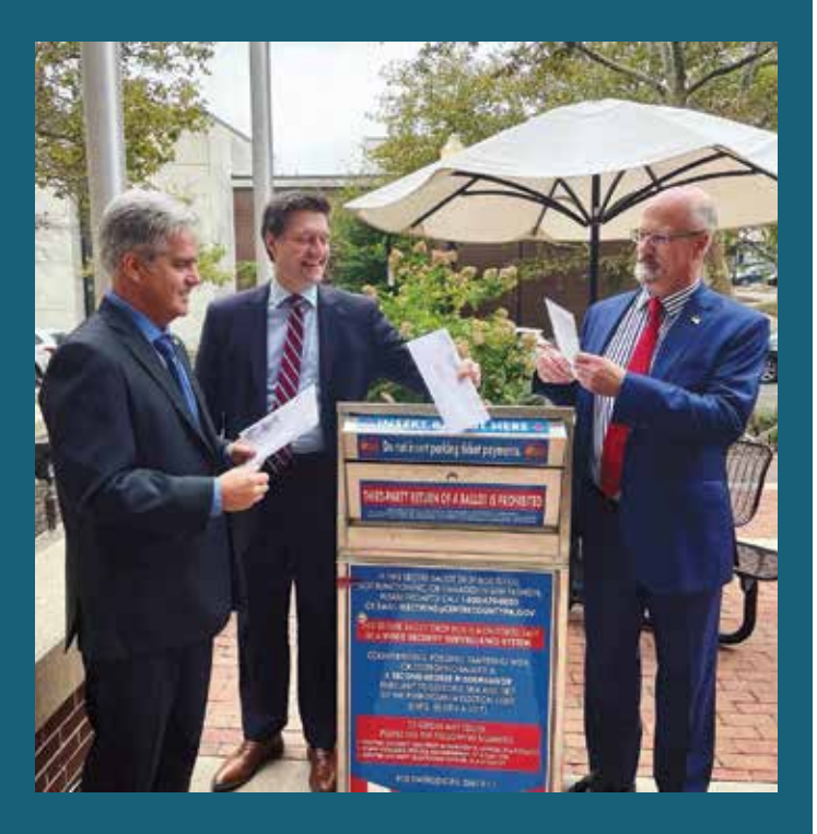
Rep. Conklin and Centre County Commissioners Michael Pipe and Mark Higgins drop off their mail-in ballots ahead of the November election in 2021.

My legislation, which I've been working on with local elections officials and others, seeks to address their legitimate concerns, update our laws and create a system that not only expands voting access and makes voting easier, but also strengthens trust in the system.